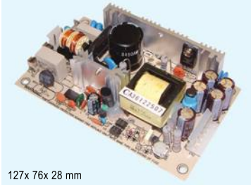
127x 76x 28 mm