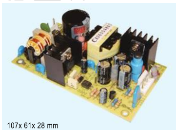
107x 61x 28 mm